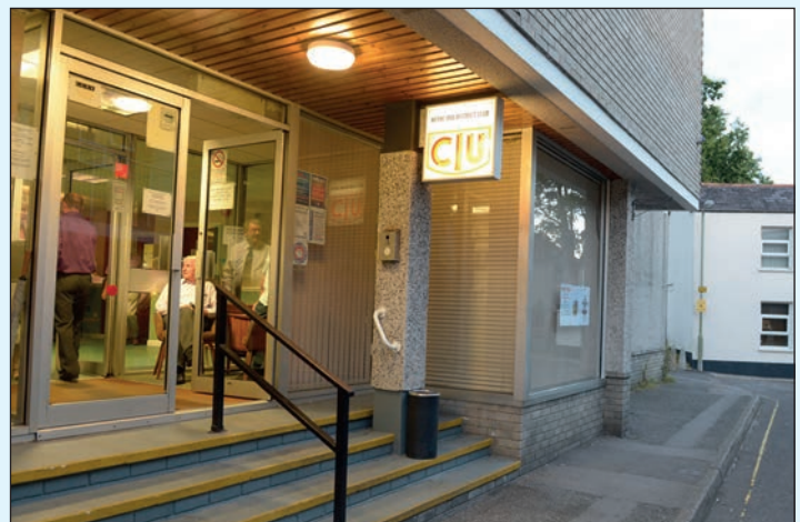
The club's front door