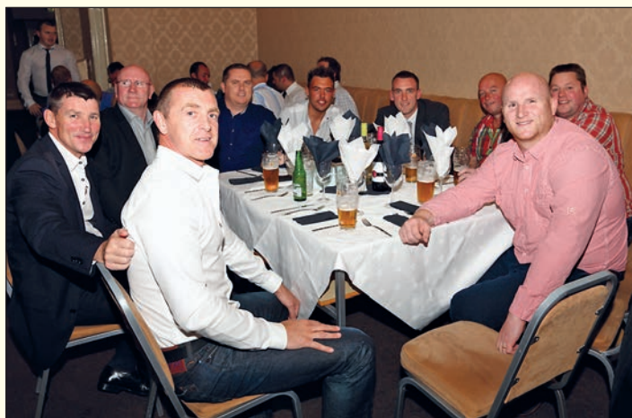
Former football international John Hartson (front right) was among 140 guests at the fundraising evening at Briton Ferry Working Men's Club, near Swansea where the Main speaker was Jonathan Davies (left).