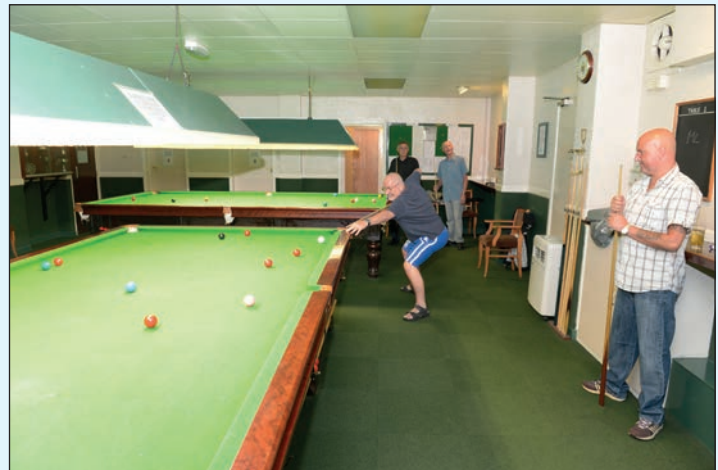
Three of the walls of the original chapel are now part of the club's snooker room. Below: The club's upstairs skittle alley.