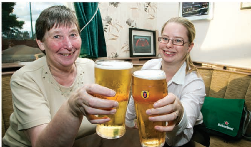
TOAST: Now that the club has turned its fortunes around, everyone is working towards a rosier future

at Glasshoughton are a credit to the club for their determination, open-minded approach to making changes - both of their own and those suggested by myself - and I look forward to working alongside them in the months ahead to build on what they have achieved through their hard work."