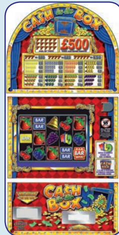
There is no MGD or VAT to pay on B3A machines

This depends on the precise details of the profit share. It will usually be the club that will be liable to register for and pay MGD. This will be a change if it is currently the supplier that pays for the AMLD licence.